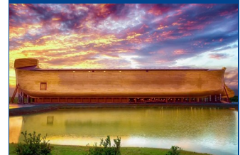
Incredible Ark Encounter