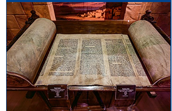
Enjoy the Bible Scroll Exhibit at the Ark Encounter